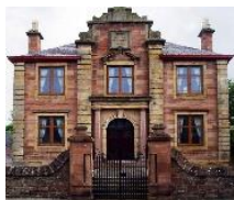
Lodge Fingal No 318