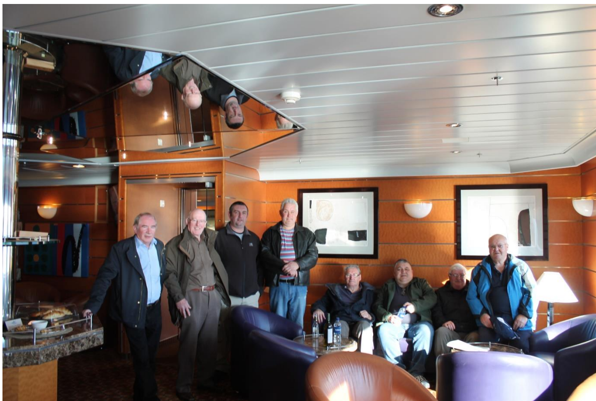
Picture of the Squaremen relaxing on the way back from a very successful trip to Stromness in Orkney on 1st October where they had 9 new Brithers join the Corporation.